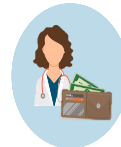
Estimate Medical Costs

When: July 9 th 9:00 AM July 18 th 12:00 PM