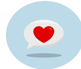
Care Management with Wellframe®

Each class contains the same information, you only need to attend one!