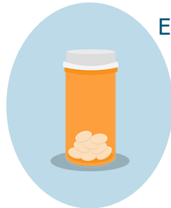
Prescriptions Delivered to Your Home

When: July 9 th 9:00 AM July 18 th 12:00 PM