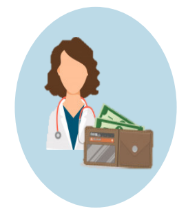
Estimate Medical Costs

When: June 6 th Noon July 12 th 9:00 am August 8 th Noon Each class provides the same information. Email: hcwellness@tompkins-co.org to be sent the class link