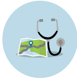
Find a Doctor