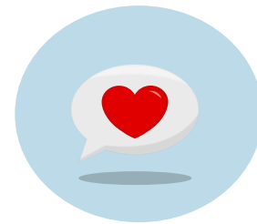
Care Management with Wellframe®

Attend this live webinar to learn all about the tools and resources you have as an Excellus BlueCross BlueShield member including telemedicine, wellbeing deals and discounts, preventive screenings and more!